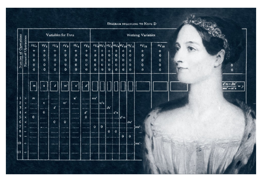
Figure 4: Ada Lovelace

Ada Lovelace<sup>16</sup> (1815–1852) was the only legitimate child of Lord Byron<sup>17</sup>. During her childhood and with her mother's guidance and encouragement, a number of skilled teachers nurtured Lovelace's talents in mathematics and logic.